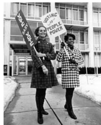
League members participate in Voting is People Power Project.

In response to the growing civil rights crisis of the 1960s the League directed its energies to equality of opportunity and built a solid foundation of support for equal access to education, employment and housing. In 1969, the League was one of the first organizations calling for the United States to normalize relations with China.